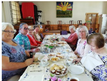
Some of those at the afternoon tea

Beginning our Christmas break sees us just over halfway through our annual programme.